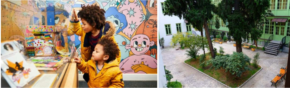
Photo credits: Left: Thackray Museum of Medicine “Normal + Me 2” Photo by David Lindsay / Right: Inner Façade and yard of the Museum, Photo: Luka Qituashvili © Museum of the Tbilisi Museums Union