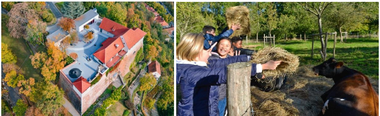
Photo credits: Left: Whole area of the museum, Photo: Mario Prevolnik © Graz Museum Schlossberg / Right: Heritage in action. Participation local schools Photo: Tine De Wilde © FeliXart Museum