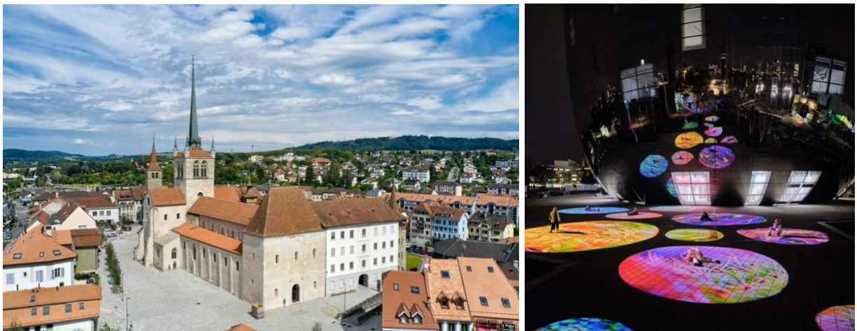
Left: View from the north-east / Right: Depot Boijmans Van Beuningen by night installation Pipilotti Rist.