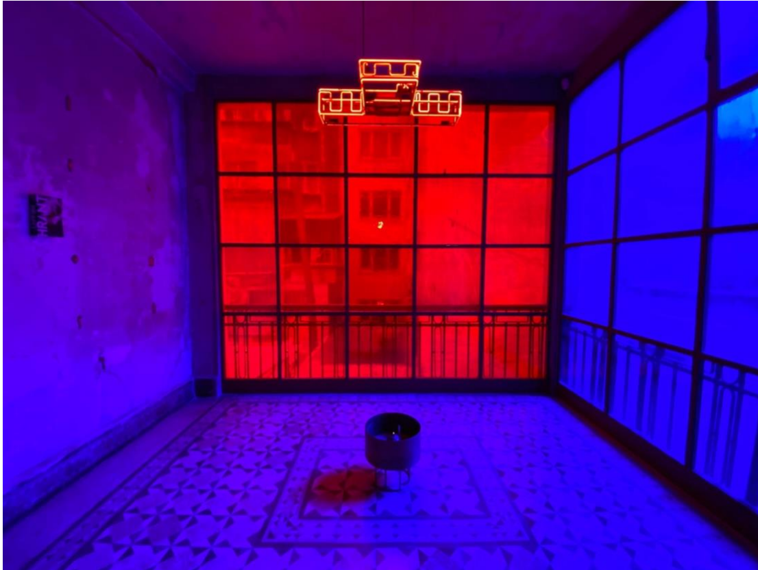
“Salt and Light” installation created by Sarkis based on the metaphor of “creating diamonds from pain”

23,5 Hrant Dink Site of Memory , Türkiye