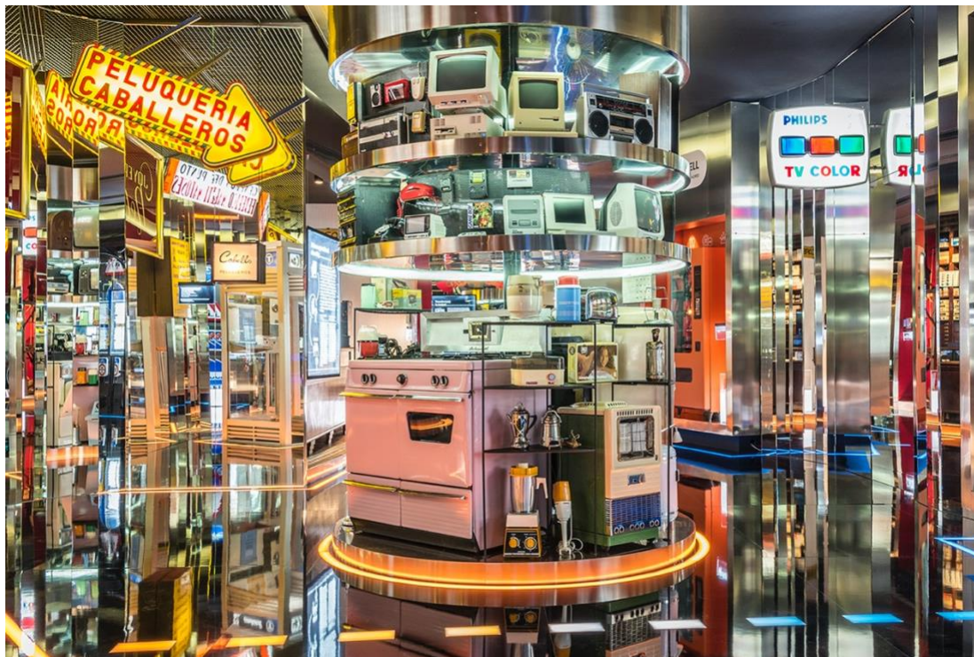
Photo credit: Permanent exhibition “Not Easy to be Valencian”. The City: Global and Local. Tower of electrical appliances. Author: Hector Juan © L’ETNO

The Winner of the EMYA - European Museum of the Year Award 2023 L'Etno, Valencian Museum of Ethnology, Spain